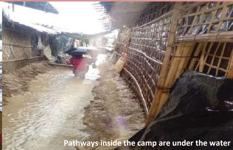
Pathways inside the camp are under the water