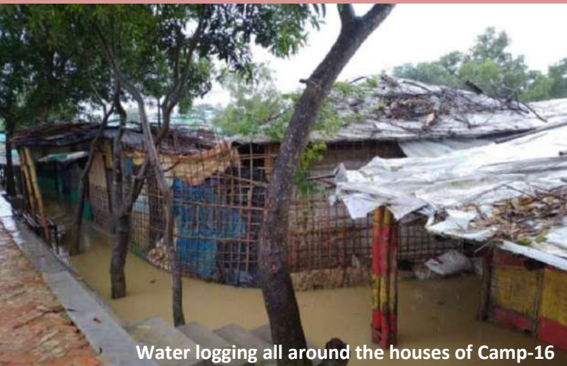
Water logging all around the houses of Camp-16